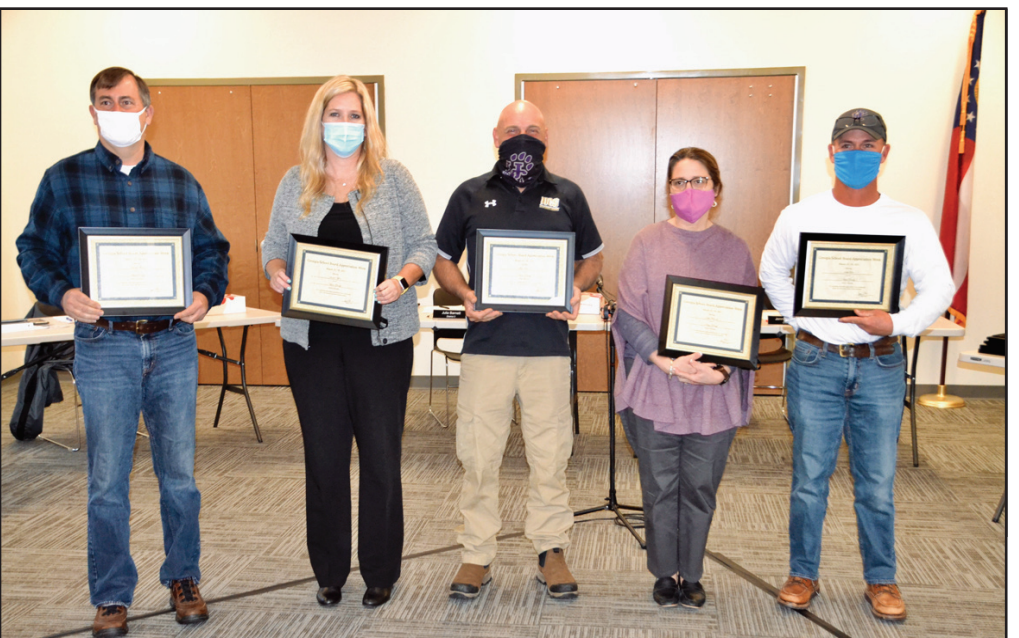
March 15-21 served as Georgia School Board Appreciation Week, and the local Board Office presented awards to the Union County Board of Education March 16.