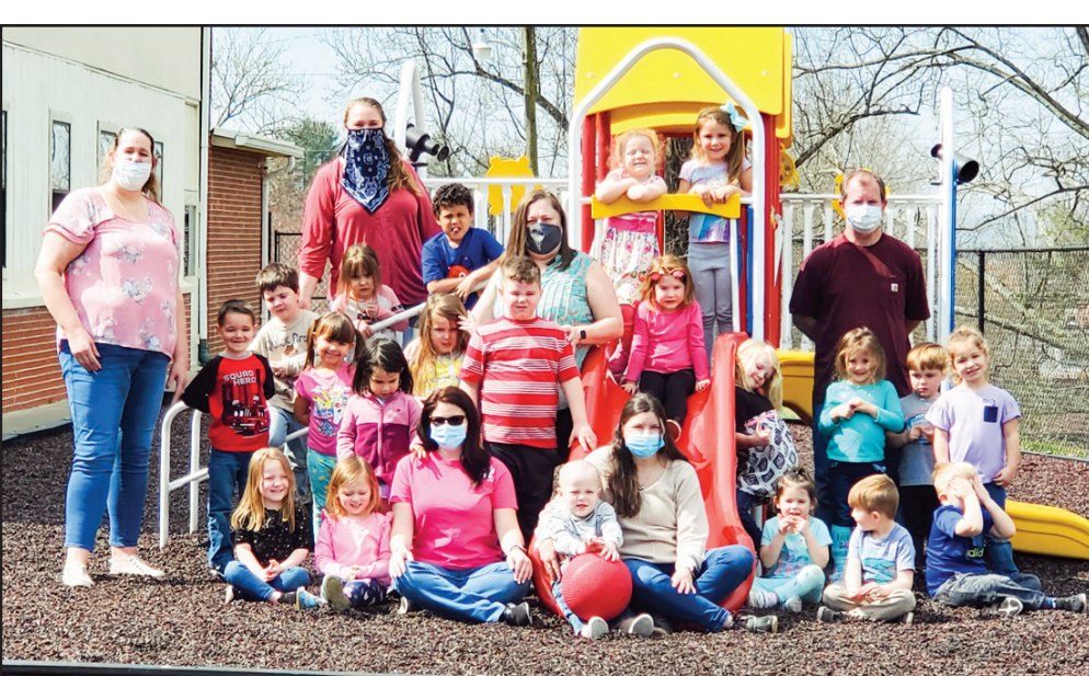
Union County Head Start is ready and able to take additional qualifying students for the